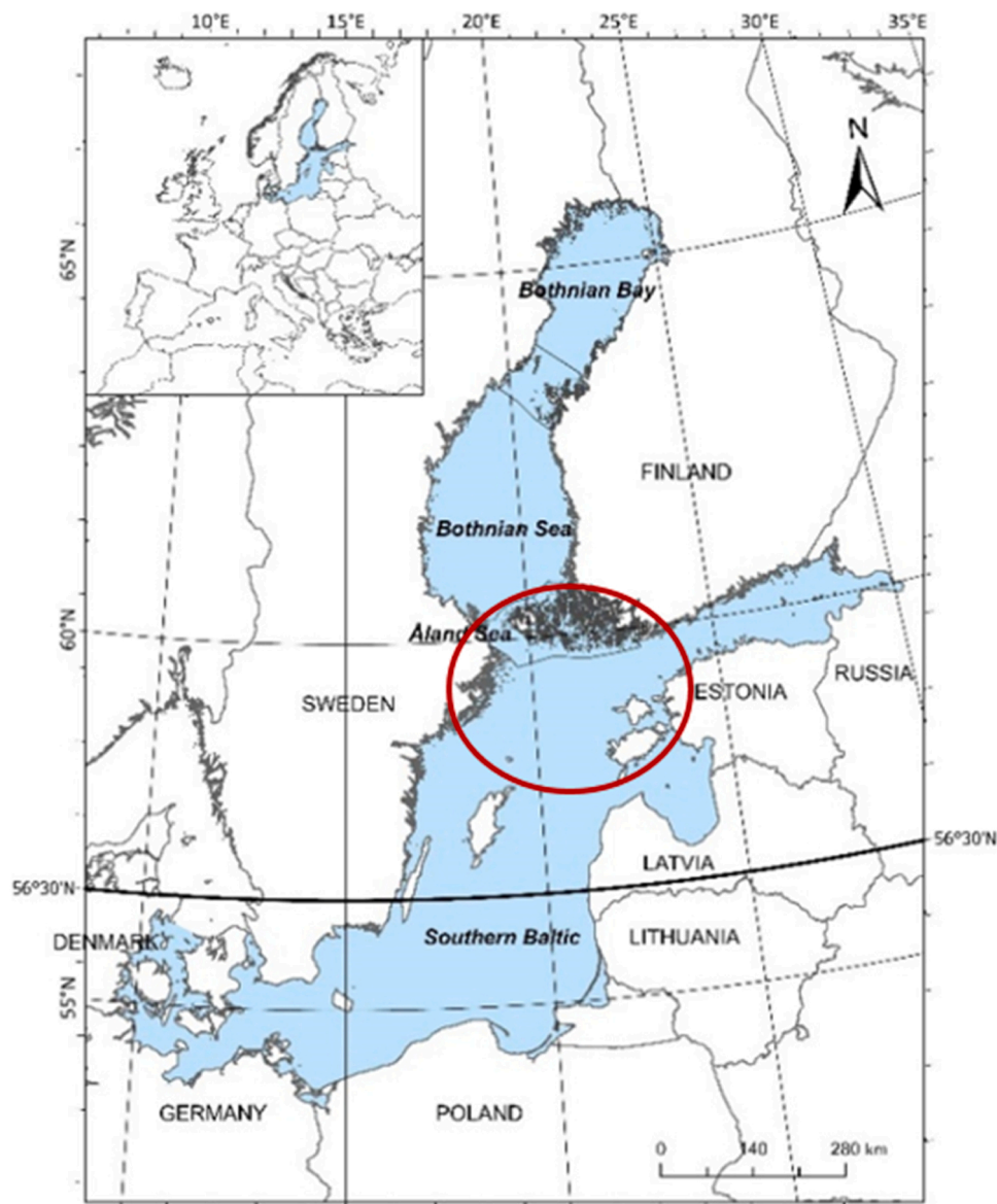
Fig. 1. Map of the Baltic Sea. The main distribution area of Baltic grey seal population is marked with a red circle (according to [69]). The latitude 56°30'N marks the line below which is the southern Baltic Sea.

The management regime of grey seal population in the Baltic Sea was established in an ecological and socio-economic situation quite distinct from the one found today. This study reassesses the criteria set in place by public institutions governing seal management in the Baltic Sea. The primary objective is to verify whether a new balance between management of grey seal populations and coastal fisheries is attainable. In